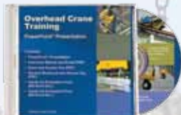
Overhead Crane Operator Training CD Item #5408 $499.00

This complete training program contains a PowerPoint® presentation, instructor manual, student workbook, answer key and 10 Journeyman Riggers reference cards.