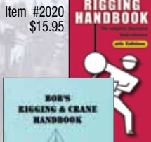
Item #2020 $15.95