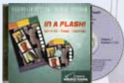
In A Flash! Rigging Inspection Training Program CD Item #5406 $395.00