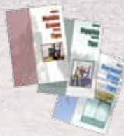
Mike's Safety Tips Item #7050 $6.99 3-Booklet Set - Excellent handout for toolbox topics & safety meetings.