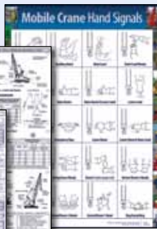
Reference Cards & Posters A full line of reference cards & posters including Journeyman Rigger, Master Rigger, Rigging with the Big Stuff, Lineman Rigger, Mobile Crane Operator and more!

This complete Signalperson Testing Package includes: examiner guide, exam score sheet, 15 written exams, answer key, qualification card template and certificate template.