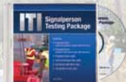
ITI Qualified Signalperson Testing package CD Item #4150 $395.00

This complete training program contains a PowerPoint® presentation, instructor manual, student workbook, answer key and 10 Journeyman Riggers reference cards.